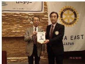
I handed the flag to my Rotary Club