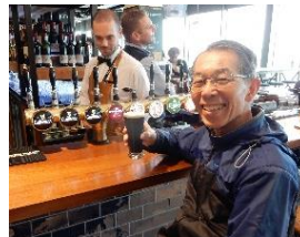
I enjoyed Guinness.